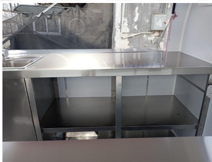
- Cabinets -