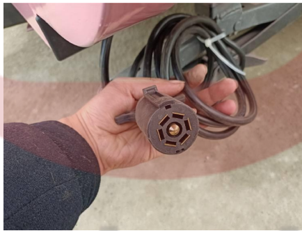
- Trailer Connector -