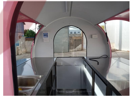
- Interior -