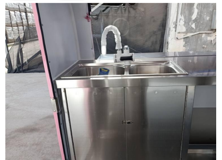
- Sink -