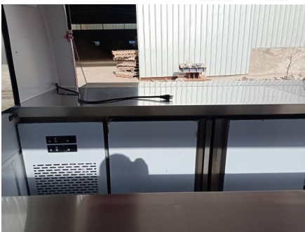
- Fridge -