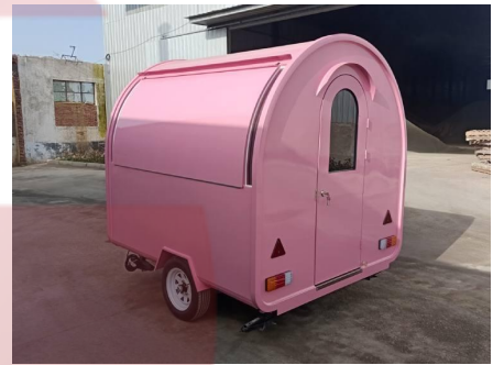
- Door -